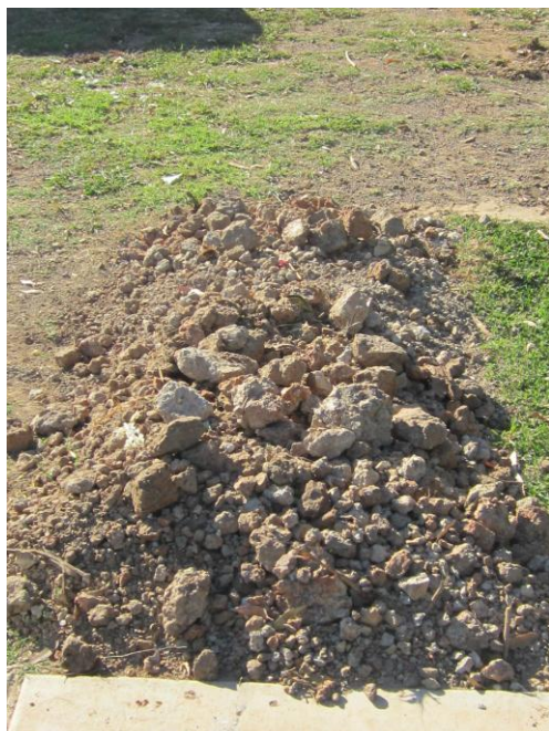
Recent Burial backfilled with excavated soil