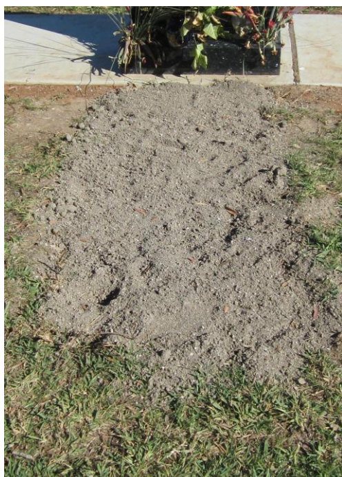
Stabilised grave covered in top soil in preparation for turf