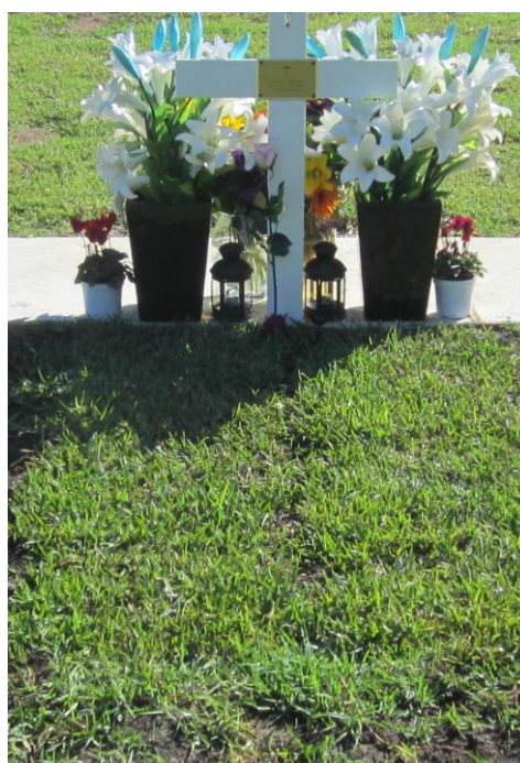
Completed turfed grave